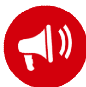
Alert & Notification (Reminder system & SMS integration)