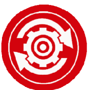
Circular & Certificate (Bulk certificate with history)