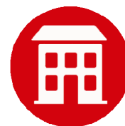
Hostel Management (With complaint & alerts/notifications)