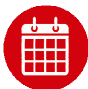
Academic Calendar & News (With instant let's share concept)