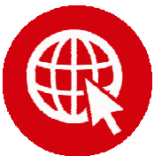
Advance Website (With online enquiry & admission)