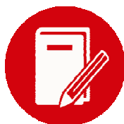
Online Daily Diary (Assignments, Circular, notice & more)