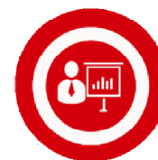
Teacher's Feedback (With customized evaluation points)