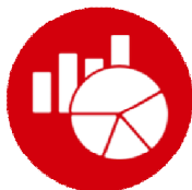
Advance Dashboards (with system usage report)

BEEDU-IMS empowers you with a set of 200+ functions grouped into 50+ modules comes in below given packages-