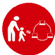
Student's Railway Concession (Online request with history fetching)