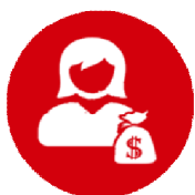
Fees & Fine (Payment Gateway & Tally)