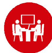
Internal Committee (With committee activity tracking)