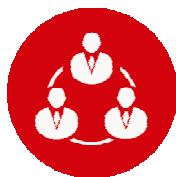
Student's Feedback (Feedback to student by all teachers)