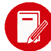
Advance Library (Advance library with DDC cataloging)