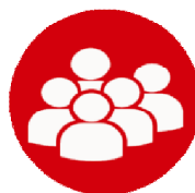
Staff Management (with I-card generation)