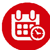
Time Table (with Teacher-subject allocation)