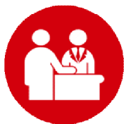
Enquiry & Admission (Online Prospectus Fees)