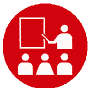
House Management (Online House Rating Board)