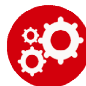
Document Management (Unlimited sub-folders with access rights)