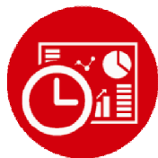
Mess/Canteen (Online account integrated on I-card)