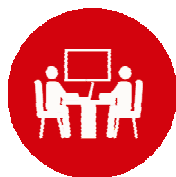
Complaints & Feedback (Direct to management personals)