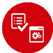
Teacher's Additional Task (Assign, add and track the tasks)