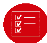
Attendance & Leave (With/without RFID Integration)