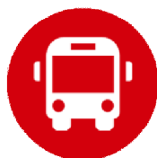
Online Bus Tracking (With/without GPS Devices)