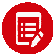
Inward/Outward (Online registers with auto reminder)