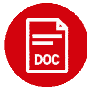
Online Notes/Assignments (Support all type file, specific students)