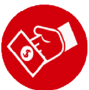
Sales/Distribution (Complete tracking with insight)