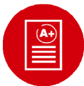
Examination (End-To-End Examination process)