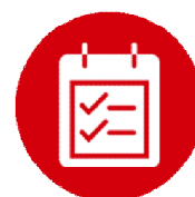
Staff Attendance (RFID Integration)