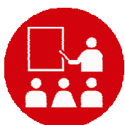
Teaching Plan (With advance tracking dashboard)