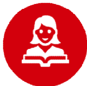
Student MIS (with I-card generation)